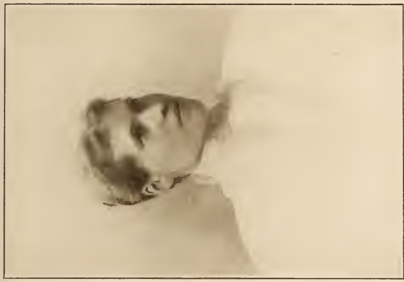
THE ONE WHO EMIGRATED

The horizon of her life is indicated by her impassive features.